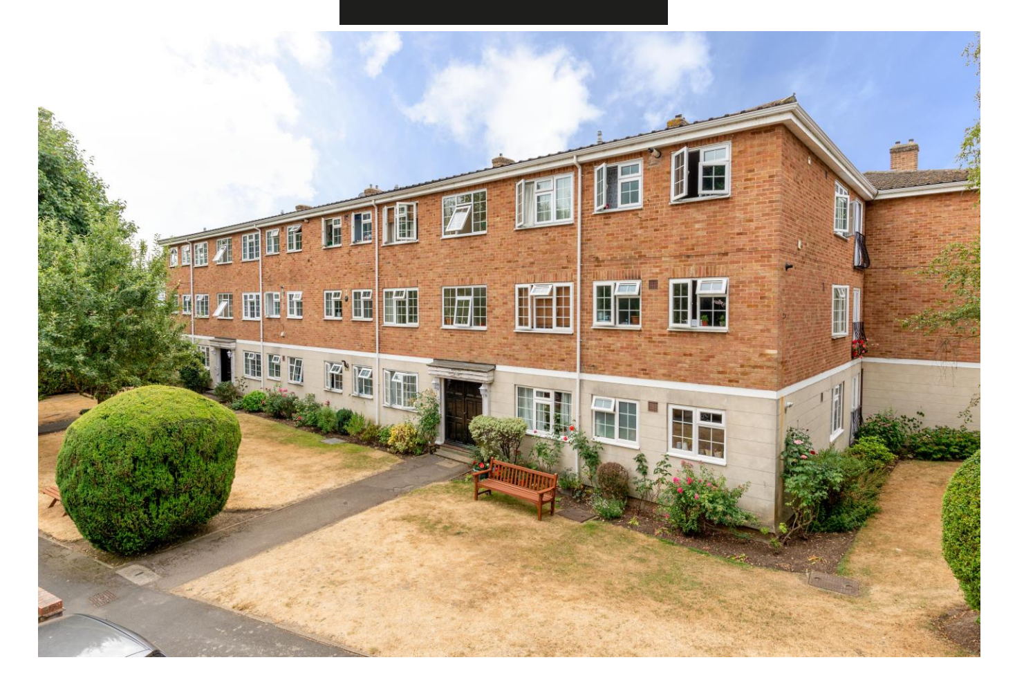
58 Gainsborough Court Walton-On-Thames Surrey KT12 1NL